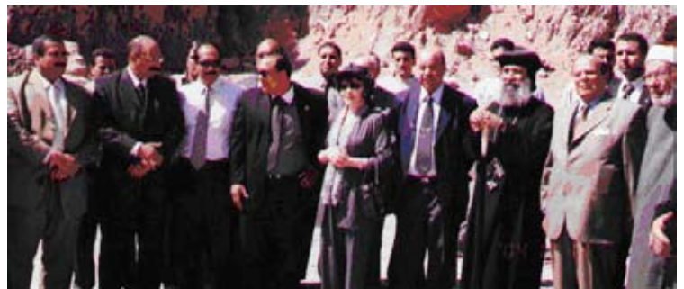
On October 14, 2004, USFMEP organized a Peace March in Taba, Egypt after the bombing of a Red Sea resort. The Federation invited the Vatican Ambassador, among others, to participate in this march as an act of denouncing all forms of terrorism.