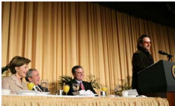
(From left to right) First Lady Laura Bush, President George W. Bush, Senator Mark Pryor and singer/activist Bono.

The USFMEP attended the National Prayer Breakfast in Washington, D.C., in February, 2006. Notable guests included U.S. President George W. Bush, First Lady Laura Bush, his Majesty King Abdullah of Jordan, and rock star/activist Bono.