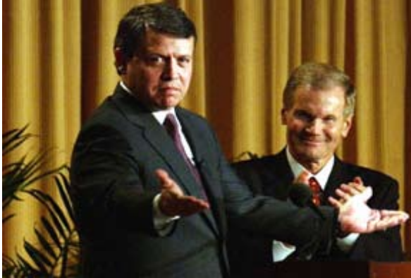
King Abdullah of Jordan at the 2006 Prayer Breakfast.

The USFMEP attended the National Prayer Breakfast in Washington, D.C., in February, 2006. Notable guests included U.S. President George W. Bush, First Lady Laura Bush, his Majesty King Abdullah of Jordan, and rock star/activist Bono.