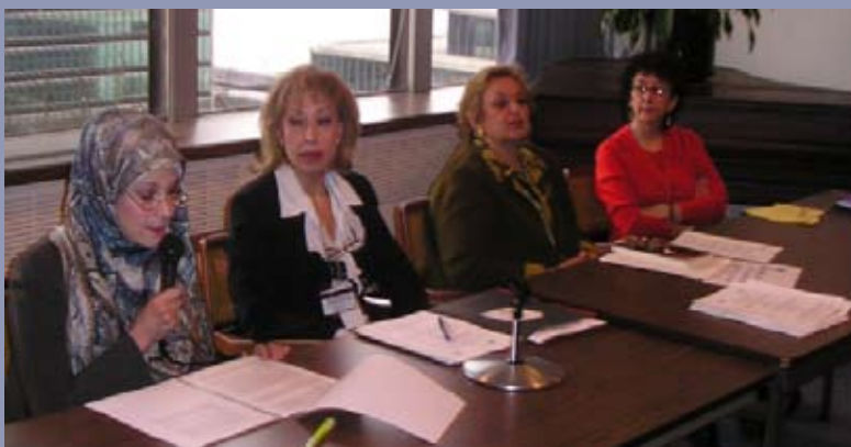
“The Rights of Muslim Women: Islam and Tradition” panel speakers.