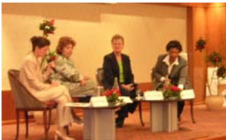
The assistant to the under-secretary of Condoleezza Rice also attended the Summit.