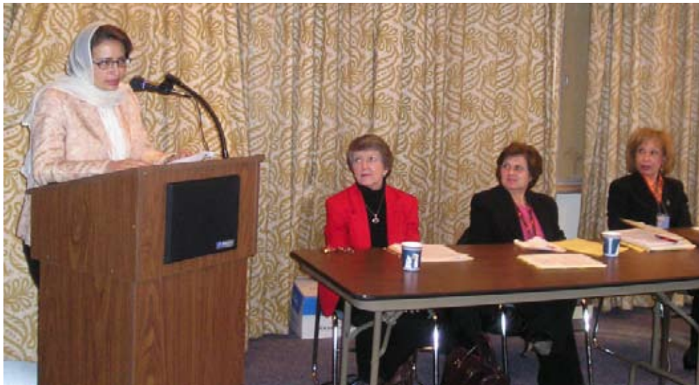
Education for Women in the Arab World