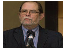
The Rev. Chris Ferguson - Ordained Minister - United Church of Canada. World Council of Churches Representative to the United Nations in New York.