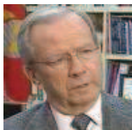
Robert C. McFarlane Former National Security Advisor to President Ronald Reagan from 1983 to 1985. Chair of energy development firm in Washington, D.C.